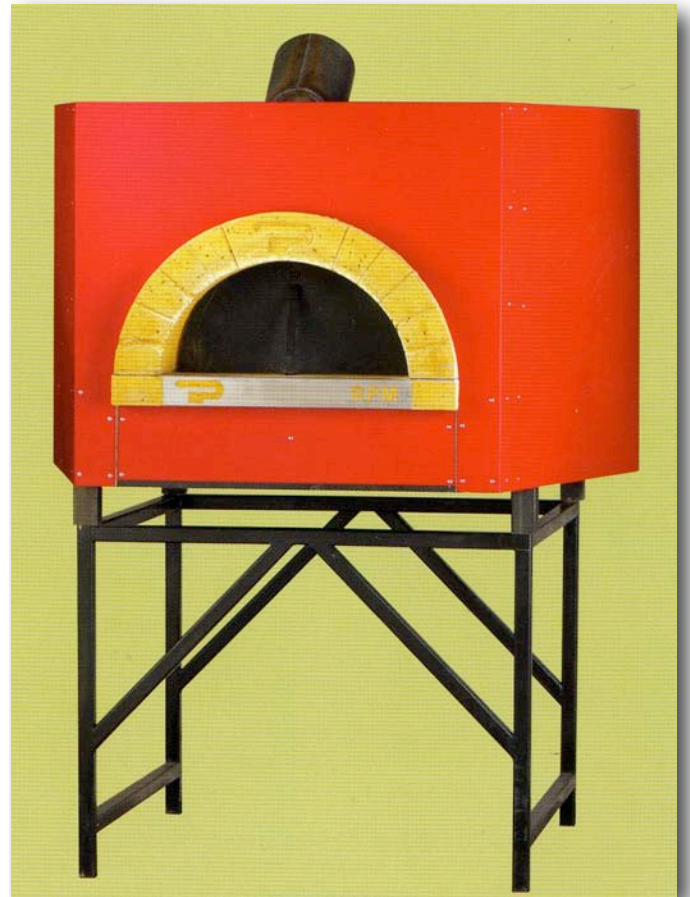
The Modena—advanced technology in an assembled oven.