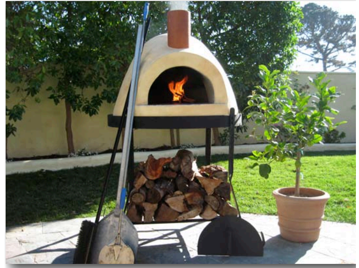
Fully finished and ready to cook; Just set it down and go.

The oven includes a steel door. Optional accessories include a pizza placing peel, a round turning peel, an oven brush, oven rake, oven shovel and infrared thermometer.